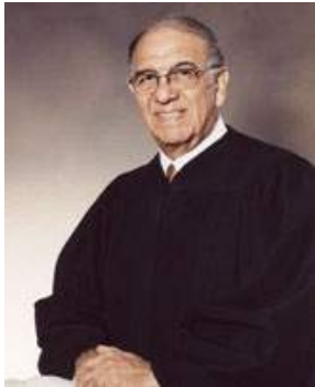
Henry Santana (D)

I completed my Doctoral degree, master’s degree and bachelor’s degree and currently serve as the Justice of the Peace for Precinct 1, Place 2. This precinct is the largest in Nueces County where 3 of the nine Justice of the Peace serve as Judges. I have served as a Justice of the Peace for the past twenty years and presided over 60,000 criminal cases and 25,000 civil cases.