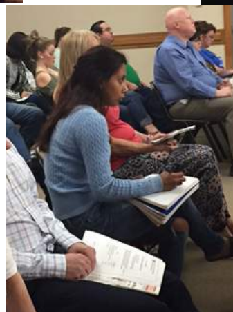
Interested listener takes notes