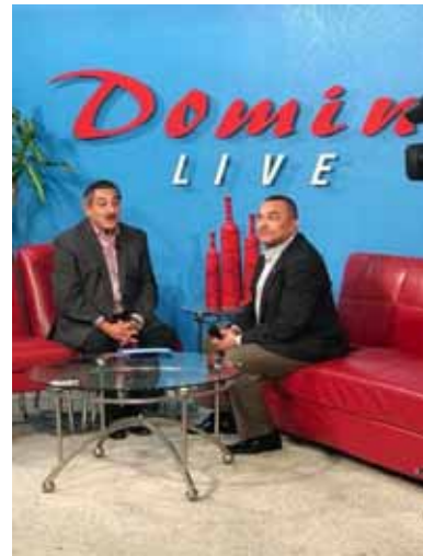
Sunday Morning TV Interview