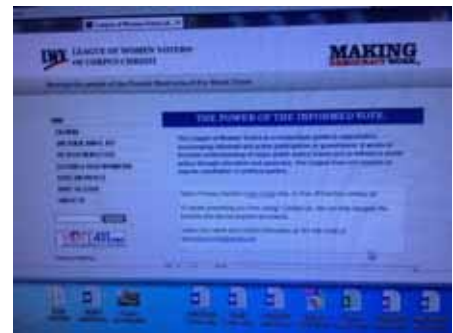
LWVCC web screen shot