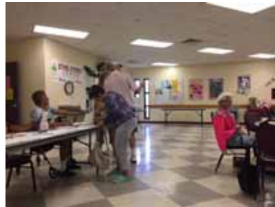
Prospera Property with flyer distribution