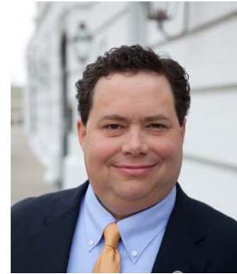
Blake Farenthold (R)

Do you think that the increasing violence in communities across the US calls for a federal response? And if so, what would it be?