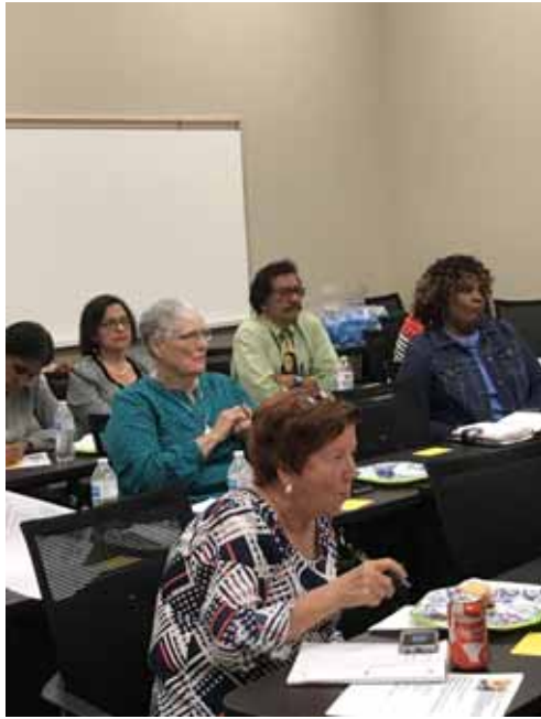
Organizations represented at the 100th anniversary planning meeting included the YWCA, Delta Sigma Theta, American Association of University Women, LWV-CC, and Executive Women International. A second meeting will be held in late August.