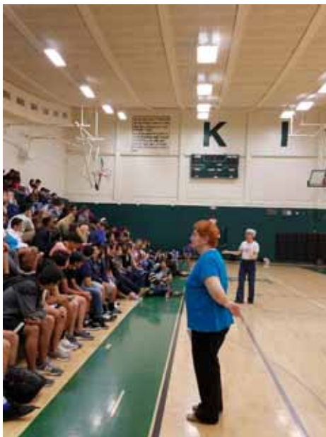
It looked like a pep rally but the event was a successful voter registration presentation held in mid-April at Richard King High School. Several members of the League's Voter Services team were present to encourage and help register graduating seniors.