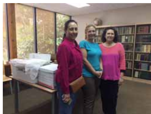
pictured in the Collections Department after the April 25 delivery.