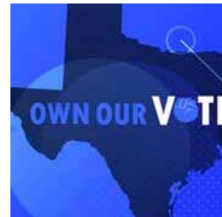
Own Our Vote and When You Vote are two additional resources with excellent video clips. Check them out!