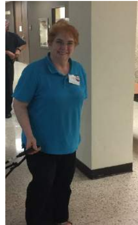
Tireless LWV-CC Member—Voter Registration Champion