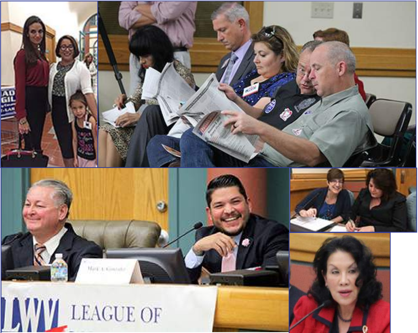
OCT. 20 CANDIDATE FORUM —The League’s second Candidates Forum of the Fall 2016 political season was well-attended and spotlighted about 20 candidates seeking election as Mayor, City Council members, Del Mar College Board of Regents, and Corpus Christi ISD trustees. Smiles generally abounded, as evidenced in the photo collage above. (From top left and clockwise): County Clerk